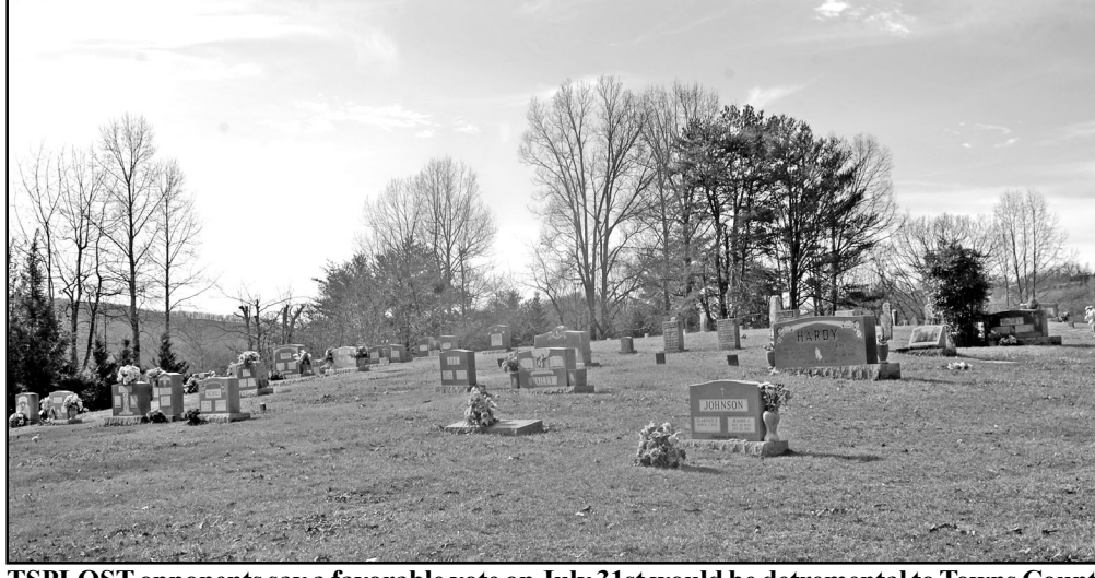
TSPLOST opponents say a favorable vote on July 31st would be detremental to Towns County along Georgia 17 where a 1.1 mile, five-lane expansion project would destroy a church and a cemetery and several businesses.

"All we can do is hope and pray that there are enough people out there that are against this thing," he said. "We have to do our part and hope that folks in Hall and Forsyth counties send a message to the State Capitol on July 31st."