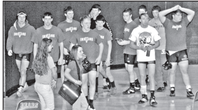
owns County grapplers made it to the consolation finals in Area 3-A Duals at Holy Innocents.

"I couldn't have been more proud of the kids," he said. the kids that wrestled, which